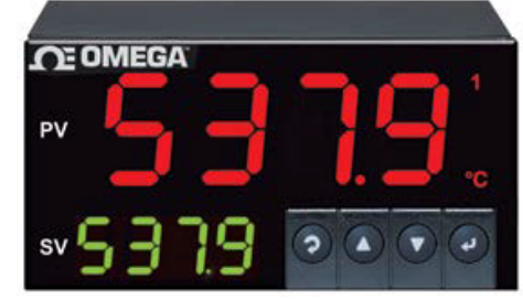
Connect your OS137A to a precision controller model CNi8DH, sold separately.